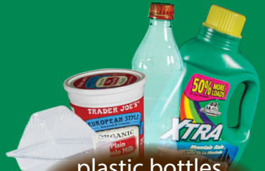
plastic bottles, tubs & packaging