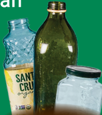
glass bottles & jars