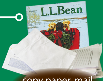
copy paper, mail & magazines