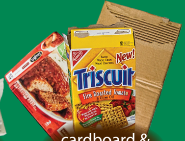
cardboard & boxboard